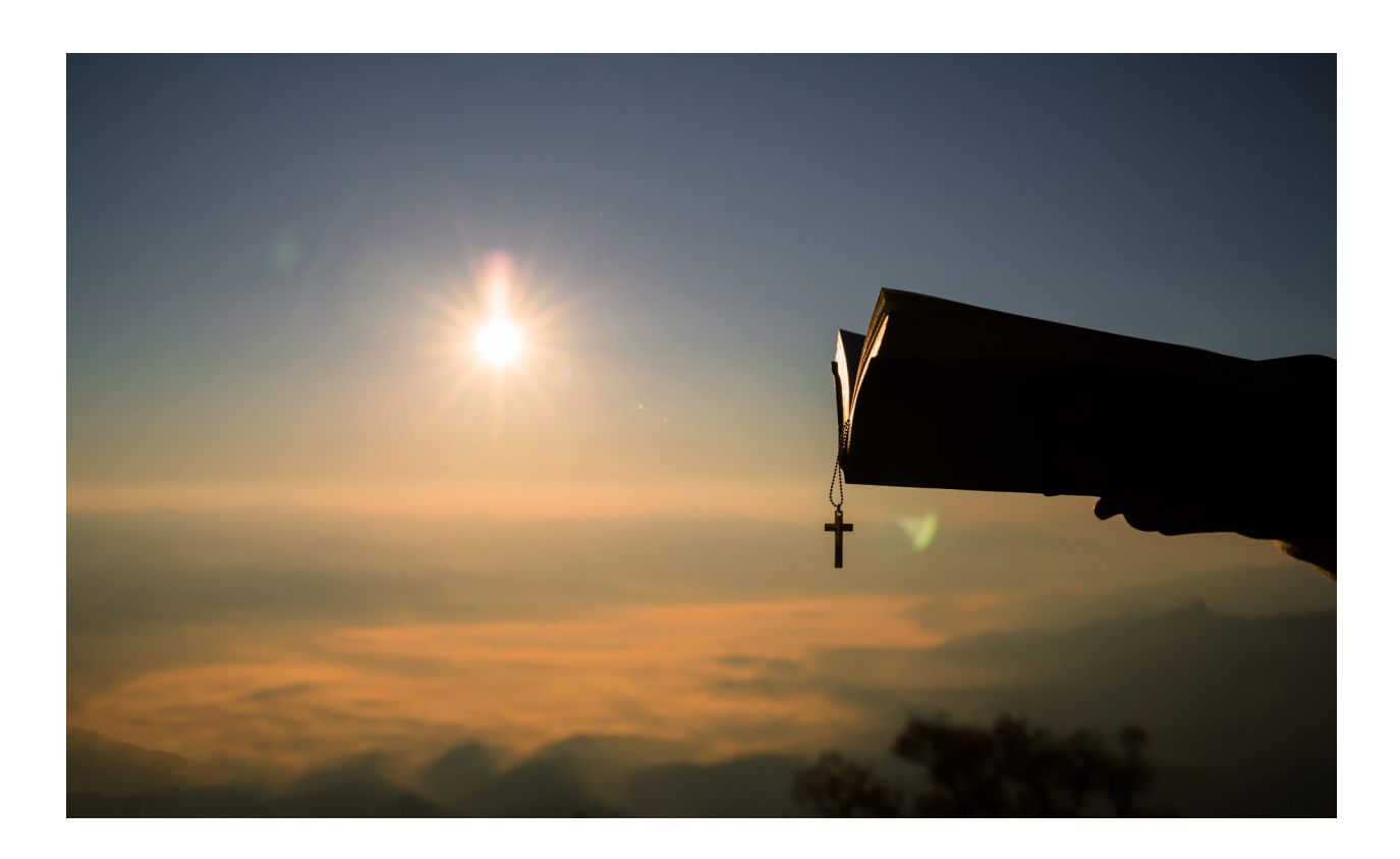
Reflect on how Christ asks us to show our love for Him. Is there any place in your life that you are acting on rules more than your love of Christ?