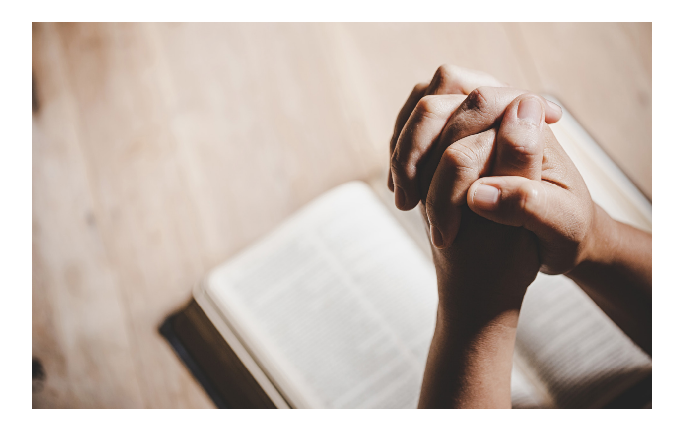
Reflect on how Jesus feels about corruption of the gospel/temple. How do you abide in truth in your everyday life?